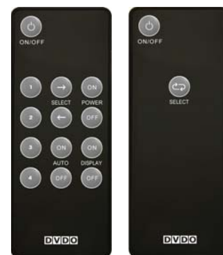
Infrared Remote Control with Discrete codes (Pro and Consumer Models)