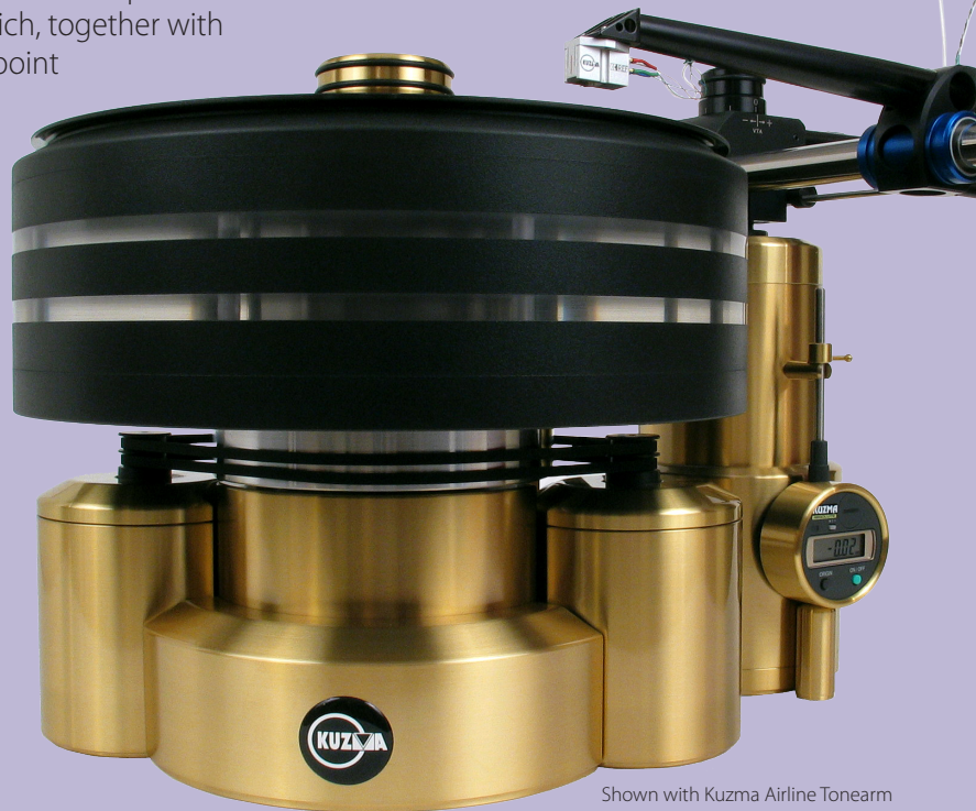
Shown with Kuzma Airline Tonearm

The movable part is supported via a linear ball bearing 30mm in diameter and 100mm in length, which gives firm support while allowing VTA to be easily changed. Adjustments can be made over a range of 80mm, each turn of the knob representing precisely 0.1mm. In order to simplify adjustment, a micrometer gives a digital readout in the range of 12mm with a tolerance of 0.01mm, and these adjustments are easily repeatable.