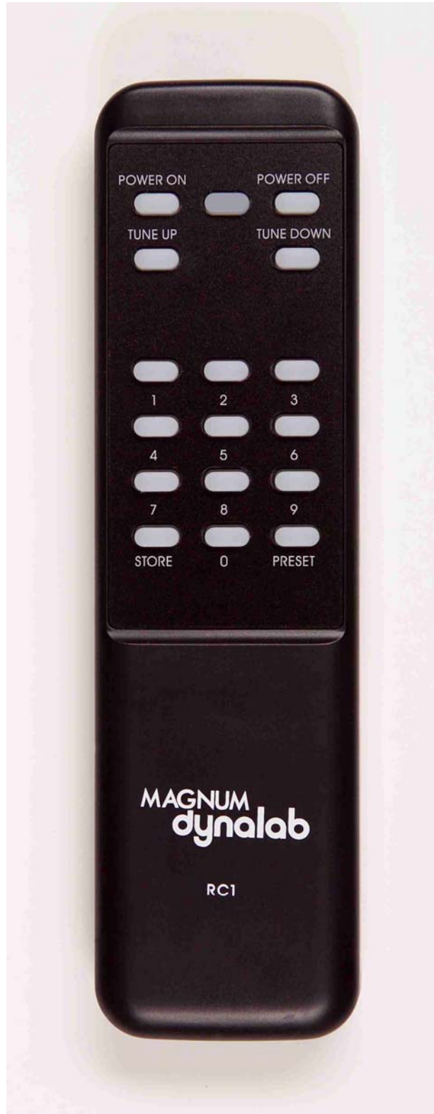
IMAGE OF RC1 REMOTE