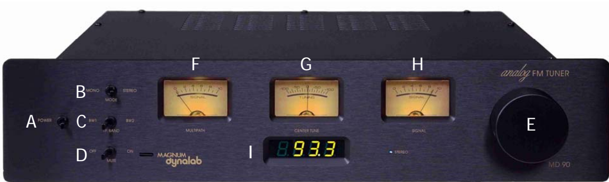
IMAGE OF MD 90T