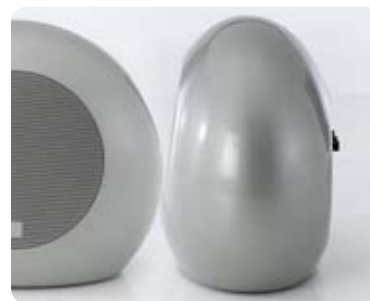
SOUNDSUB™ PSW8 / PSW10

The SP-1 is a discreetly designed miniature half-sphere satellite speaker that can be easily installed in a variety of locations. Despite its modest dimensions, the SP-1 is a true 2-way system housing a high performance coaxial driver, producing a wide frequency range with exceptional dispersion characteristics. At home, as part of a 5.1 home cinema system the SP-1 delivers a surprisingly "big" powerful sound. Can also be used with high performance computers where its lively articulate sound takes full advantage of modern computer sound cards.