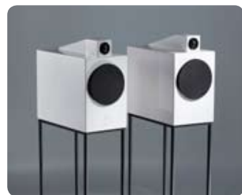
OCTAVE SIGNATURE BOOKSHELF

The heart of the Octave Signature is the 5¼" bass midrange driver, equipped with an enormous 3" voice coil inside of which is placed the magnet system. This unusually large voice coil configuration is three times larger than on conventional drive units of this size. Bass output from this drive unit is surprisingly deep and powerful yet very articulate.