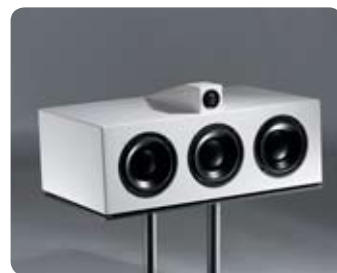
OCTAVE SIGNATURE CENTRE

Profiled to allow the Octave Signature Bookshelf to sit on top to create a single visual structure, the Octave Signature Subwoofer takes up no more floor space than a pair of speaker stands. Technical highlights include isobaric loading which reduces the cabinet size by half for the same bass extension. A built in passive crossover designed to create a seamless transition from the Octave Signature Subwoofer to the Octave Signature Bookshelf.