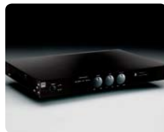
SIGNATURE AMP 2100

Based on the Octave Signature, the Centre uses the same woofer and tweeter but adds 2 extra woofers to create a powerful and articulate centre speaker system. By placing the tweeter on top of the cabinet above the midrange unit, the Octave Signature Centre creates a more stable sound stage, particularly when listening off axis.