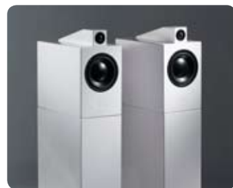
OCTAVE SIGNATURE FLOOR-STANDING

The heart of the Octave Signature is the 5¼" bass midrange driver, equipped with an enormous 3" voice coil inside of which is placed the magnet system. This unusually large voice coil configuration is three times larger than on conventional drive units of this size. Bass output from this drive unit is surprisingly deep and powerful yet very articulate.