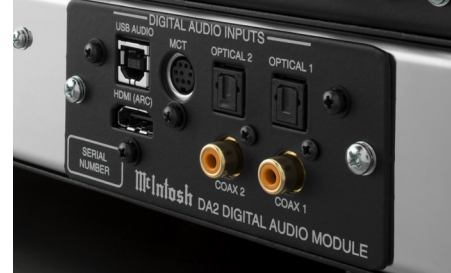
Typical DA2 installed.

For the Consumer's Protection: In order to ensure the highest level of customer satisfaction, new McIntosh products may only be purchased from an Authorized McIntosh Dealer; and, with certain limited exceptions may only be purchased over-the-counter or delivered and installed by the Authorized McIntosh Dealer. McIntosh does not warrant, in any way, products that are purchased from anyone who is not an Authorized McIntosh Dealer, or that have had their serial numbers altered or defaced.