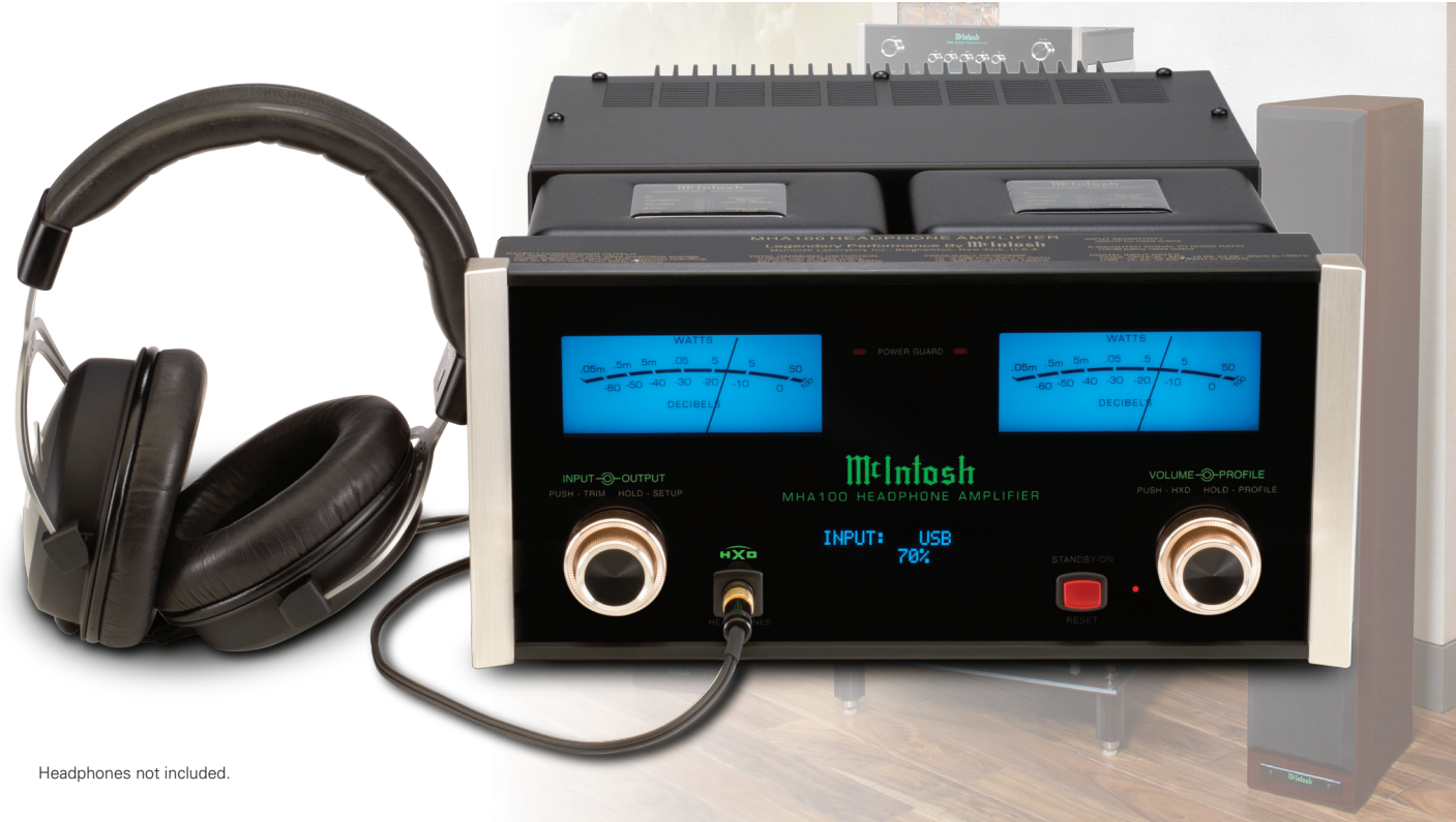
Headphones not included.