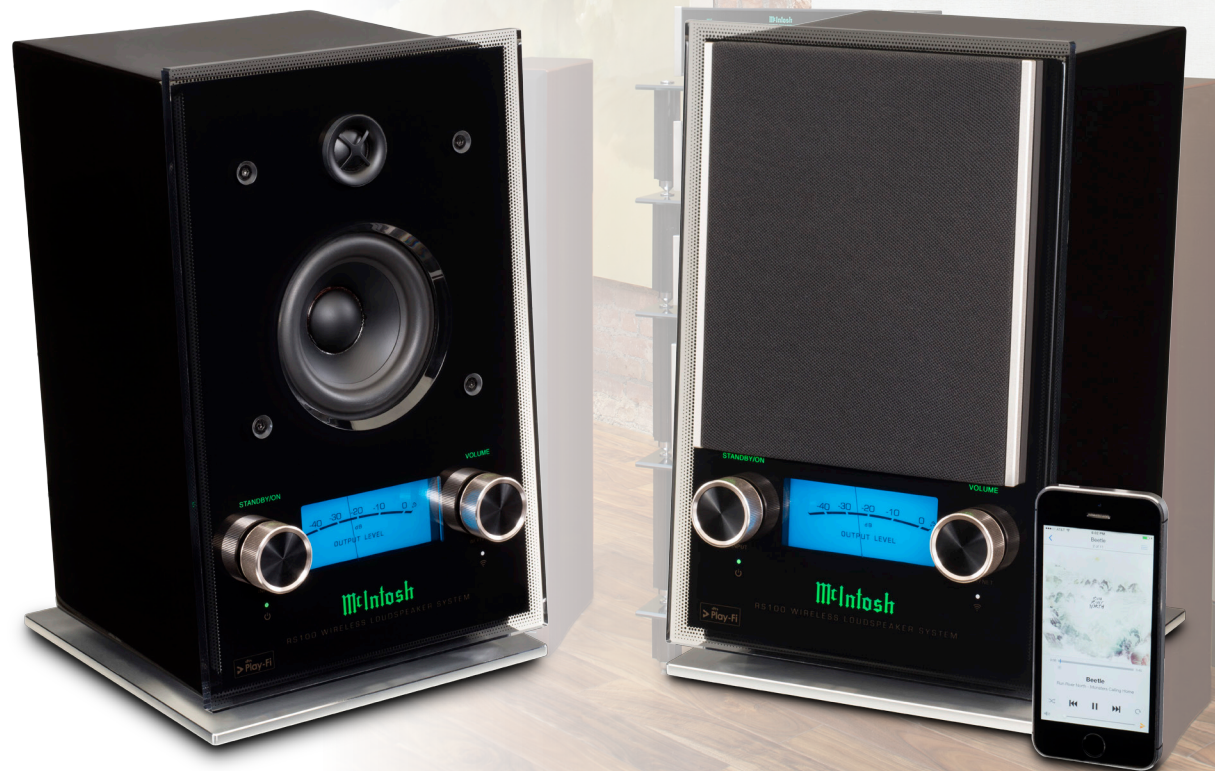
iPhone shown with DTS Play-Fi app. iPhone not included. Speakers sold individually.

1. All services may not be available in all regions; certain services may not yet be enabled for all apps; subscriptions may be required. List subject to change.