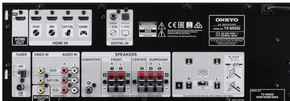
Text on receiver may vary with region.