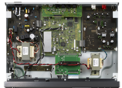
Superior Build Quality*

Specifications and design subject to modification without notice.