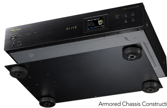
Armored Chassis Construction (16 lbs)