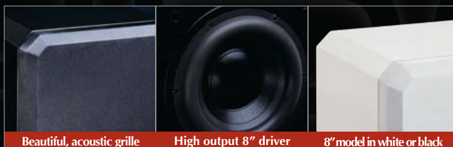
Beautiful, acoustic grille

High performance from the smallest possible form factor. That's not merely a product definition; it's the philosophy behind every Sunfire subwoofer ever made. Now, with the HRS Series, Sunfire takes this philosophy to a whole new dimension of performance and value. Consider the most obvious case in point - the HRS-8. The HRS-8 is a perfect fit for tight locations and small rooms. But don't ever let its diminutive 8" profile fool