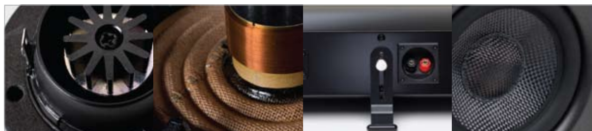
High Output Tweeter Audiophile Accuracy Center Channel Tilt Adjustment Long Throw Woofer

The HRS Sat center channel model has all the same benefits as the Satellites discussed above while also featuring two 4.5" Kevlar drivers and a purpose-designed "kick stand" that allows for custom tilting of the speaker to make a perfect audio match with any video source you are using.