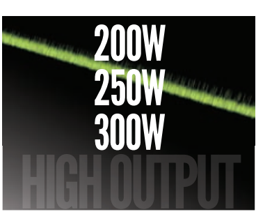
When it comes to power, more is always better. The SDS Series features Class D Digital Amplifiers for a clean and enthusiastic performance every time.

Sunfire's SDS8 is the perfect choice for systems where both small size and high output are on the essentials list. It all starts with a Sunfire digital amplifier that delivers a game changing 400W of reliable Peak power. All that power is delivered to a new front firing, 8" custom built Sunfire driver acoustically matched to an