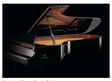
Yamaha Piano Black Finish This glossy, lustrous black finish is applied using the same techniques developed over many decades of manufacturing beautiful grand pianos. It provides a perfect visual complement to the smooth, rich sound you enjoy from the speakers.

Soavo™ Concept: A speaker that can reproduce music that offers the reality of "Natural Sound."