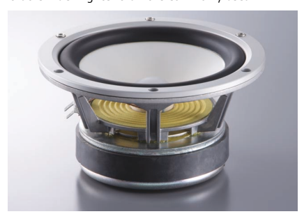
Advanced PMD cone woofer

Yamaha's exclusive A-PMD (Advanced Polymerinjected Mica Diaphragm) cones are extremely light, rigid and sturdy thanks to the use of a low specific gravity material called PMP (Poly-Methyl-Pentene) that is much lighter than the commonly used