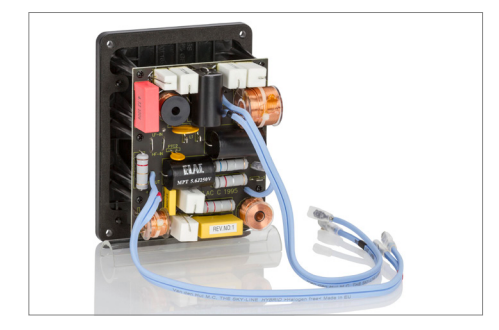
▲ BS 403, crossover and Van den Hul connection cables