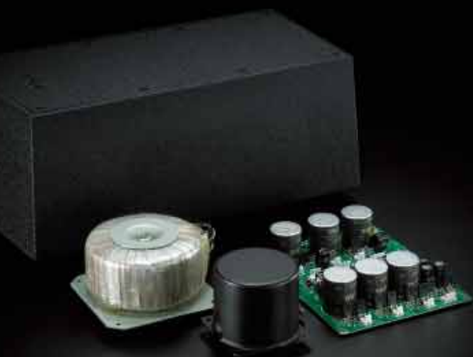
High capacity power supply

In order to stably support the heavy chassis and block transmission of vibration from below, the D600 is equipped with die-cast aluminum three-point support spikes. This extremely stiff suspension thoroughly dampens any vibration that would otherwise be transmitted upward from the support surface. The D600 provides high-quality sound reproduction from the feet up!